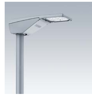
R2L2 S from 2000 lm to 14 500 lm