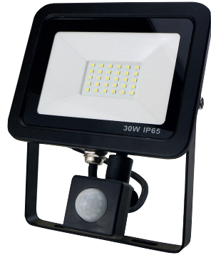
Image shown FLAC30BPIR